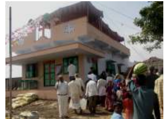
Recently constructed church