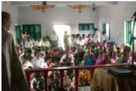
Interior of recently constructed church.

Being involved in a project like this can also multiply blessings for our local congregations, as we follow Christ’s Great Commission and catch the vision of “fields white unto harvest.”