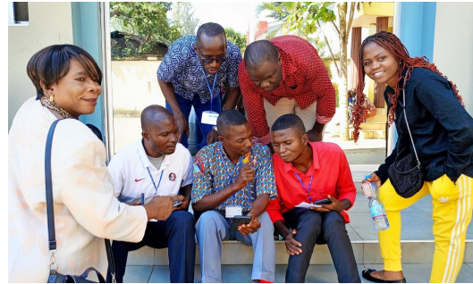
Kuba translators at training in 2023

Pray for completed work, current projects, and new projects to start!