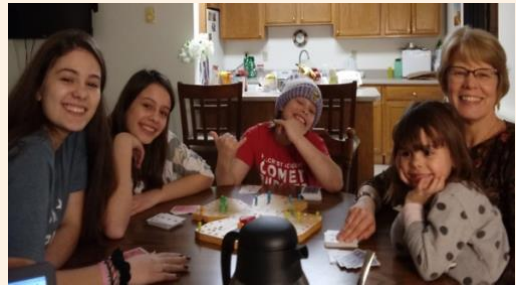
Sheltered-in-place with grandchildren