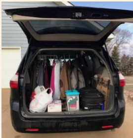
Stopped for now