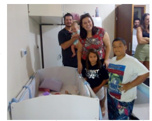
Visiting their 1st bedroom!