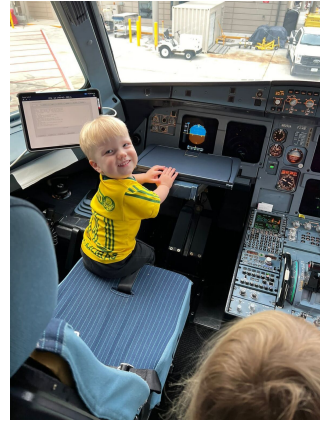
Our little pilot