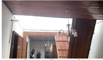
Our Bedroom ceiling caved in