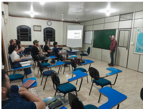
Explaining 'Adiaphora' (Loving our neighbor in the "Indifferent Things") to the Bible Schoolers in 1st & 2nd Corinthians