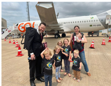
Taking off to the USA