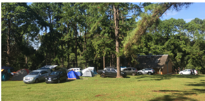
Some of our camp goers tenting outside for Bible Camp