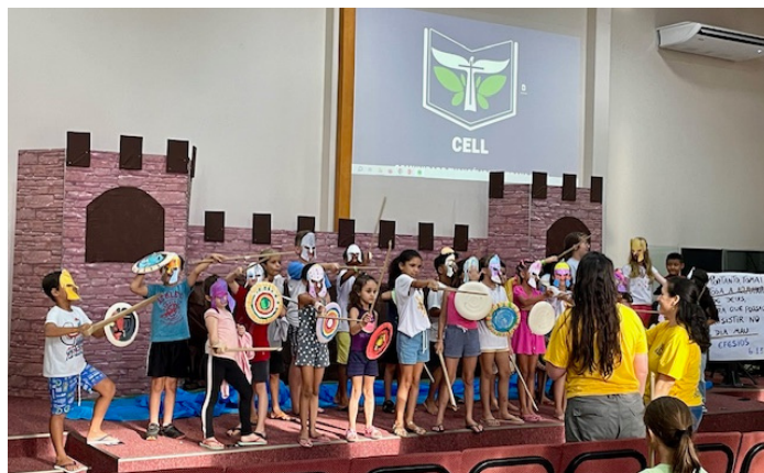
Vacation Bible School with the theme of the Armor of God