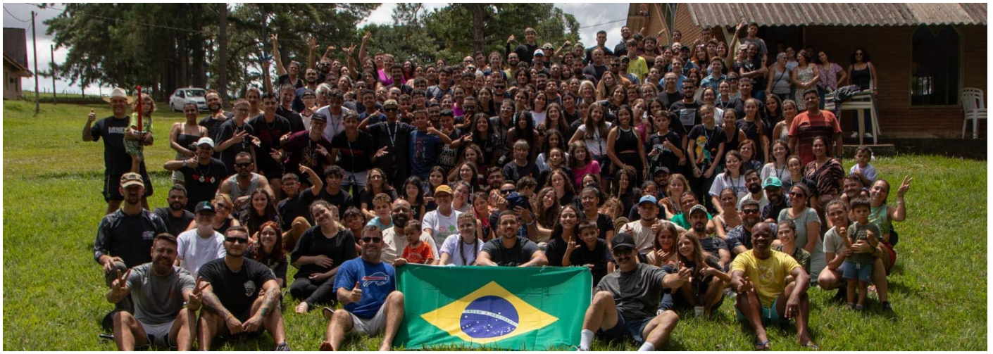
Our Bible Camp Crew

Tamba picks up 3 women weekly for women's Bible study at church. This year we are studying about the women in the Bible. This way we stay connected and growing in the Word.