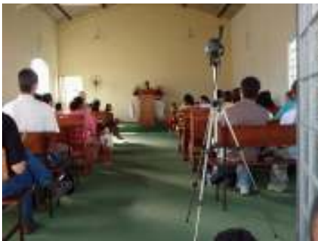
Interior of Londrina church 2003 Primavera Project

Being involved in a project like this can also multiply blessing for our local congregations, as we follow Christ’s Great Commission and catch the vision of “field white unto harvest.”