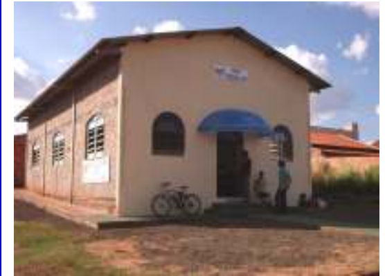
The first “Primavera Project” built in 2003